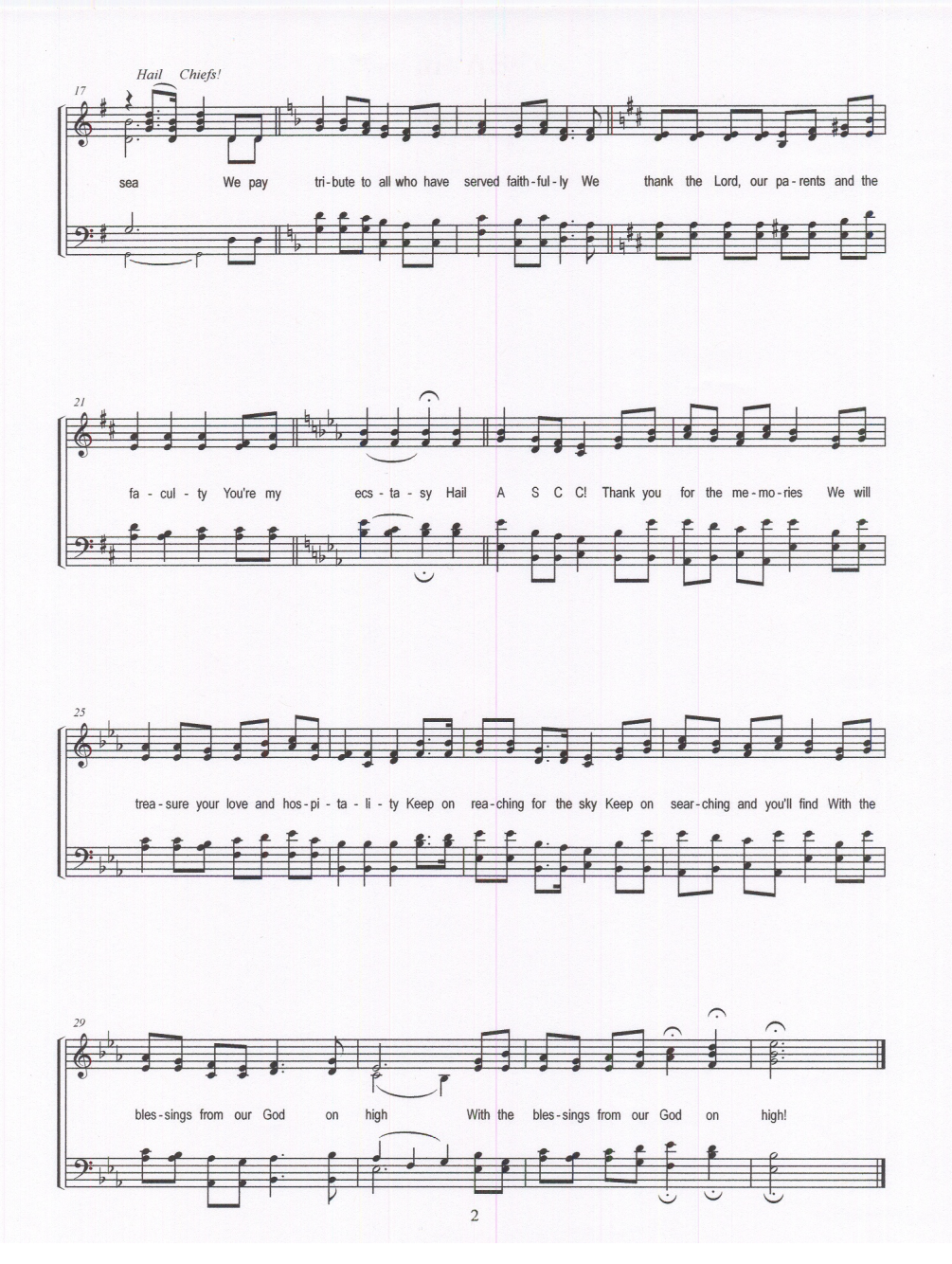
ASCC General Catalog 2016-